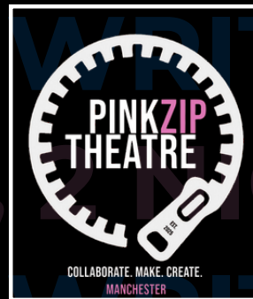
PINK ZIP THEATRE