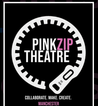
PINK ZIP THEATRE